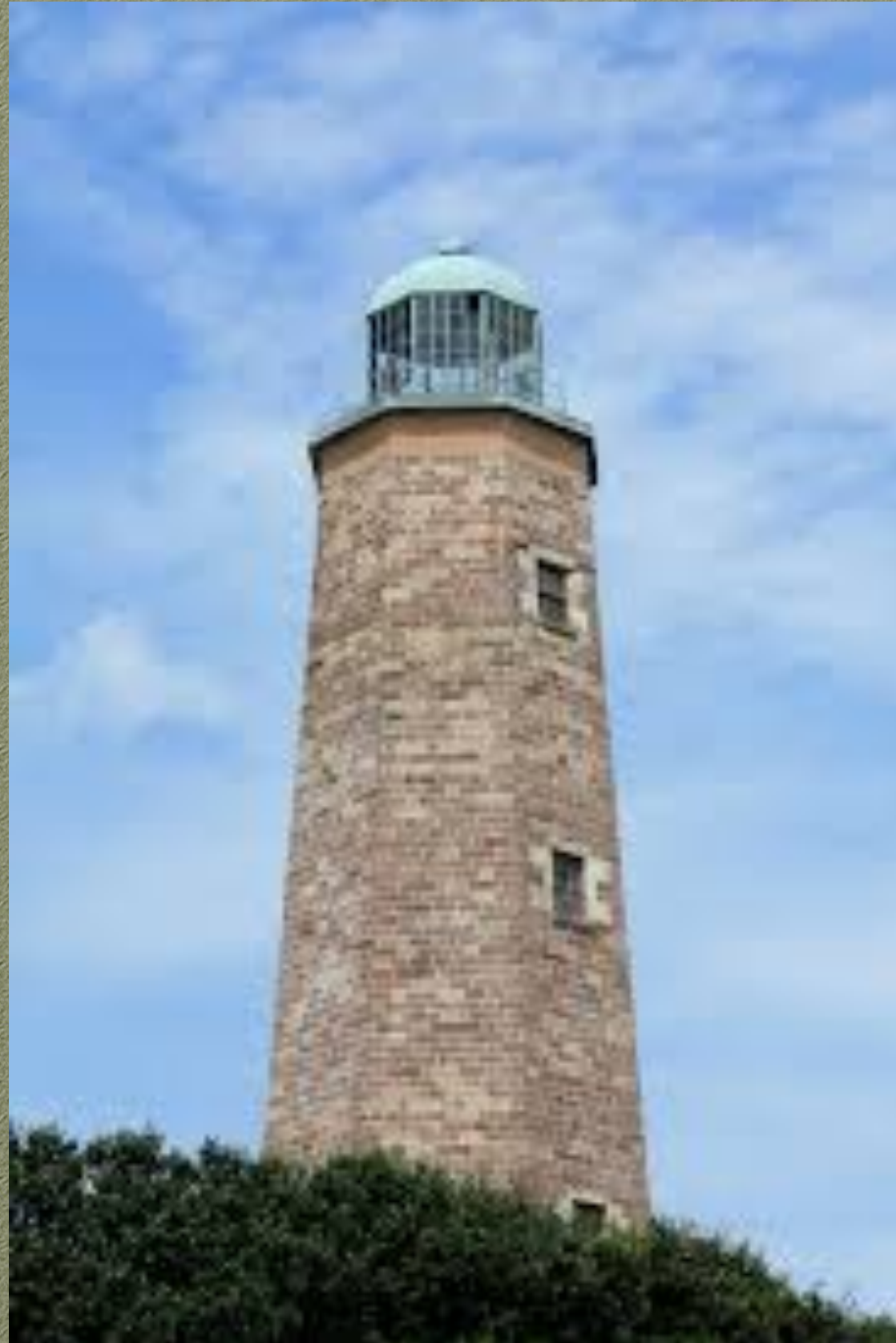
ORIGINAL CAPE HENRY LIGHTHOUSE